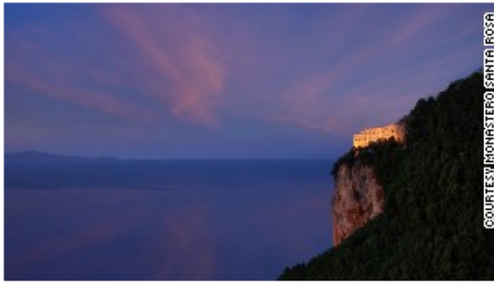
The Amalfi coast. A view that never gets old.