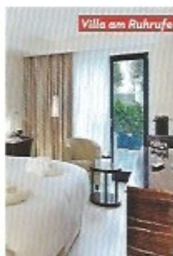
Villa am Ruhrufer

The stately Haussmannian exterior of the W PARIS - OPÉRA belies an unabashedly mod interior with 91 rooms and suites and a Catalan restaurant courtesy of Sergi Arola, near the Galeries Lafayette in the Ninth.