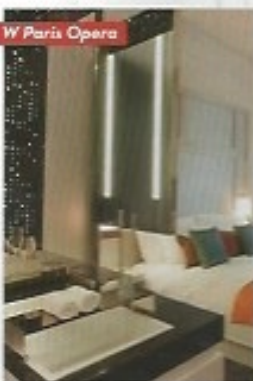
W Paris Opera